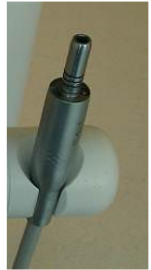
Electric Motor Will not work w/some Bien Air or Kavo attachments