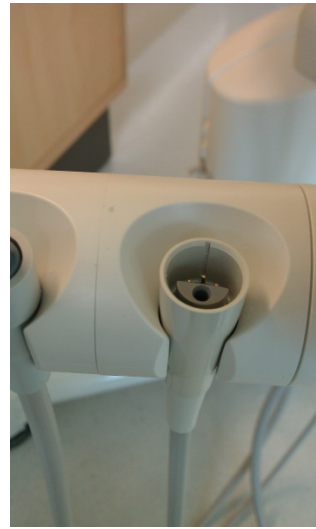
Acteon Newtron Piezo Handpiece Tube