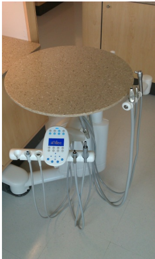
12 O'Clock Delivery Unit

Each 12 O'clock delivery unit is equipped with one 6-pin air tubing, one electric motor, and one Satelec Newtron Piezo handpiece tubing ( no handpiece ).