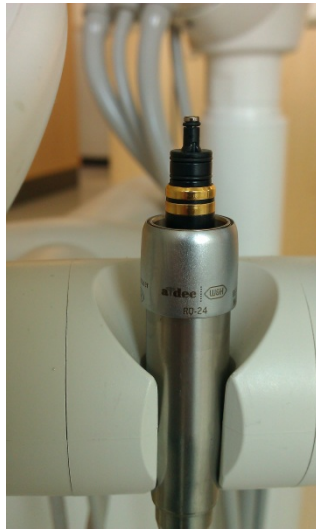
6-Pin Tube with W&H RQ-24 (removable)